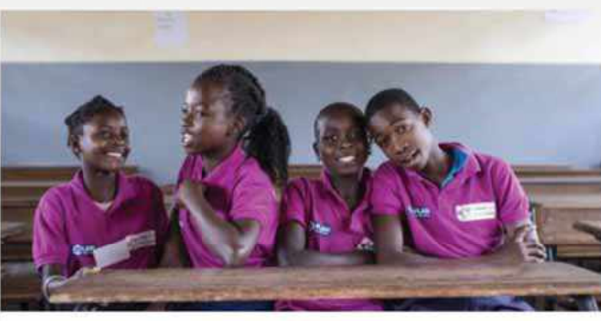
Mozambique bans child marriage >