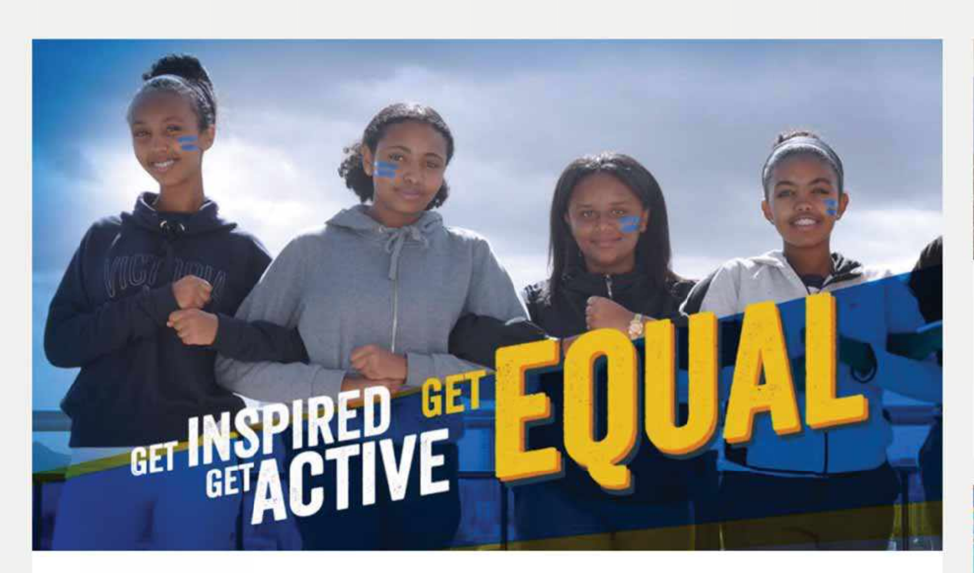
NEW: Activist Hub >